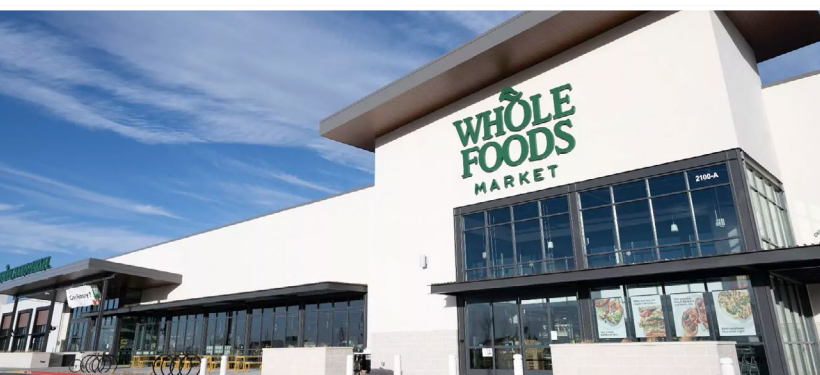
Whole Foods Market Down The Street