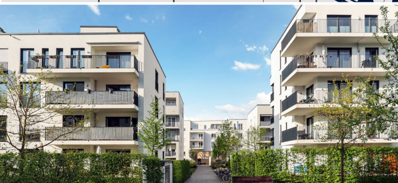
Residential Developments Underway