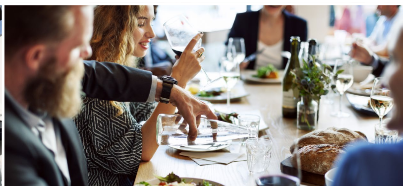
Hundreds of Dining Options Nearby