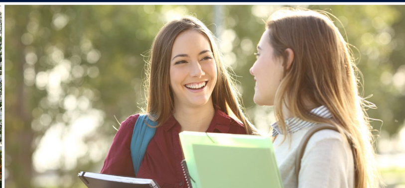
Adjacent to Nova Southeastern University