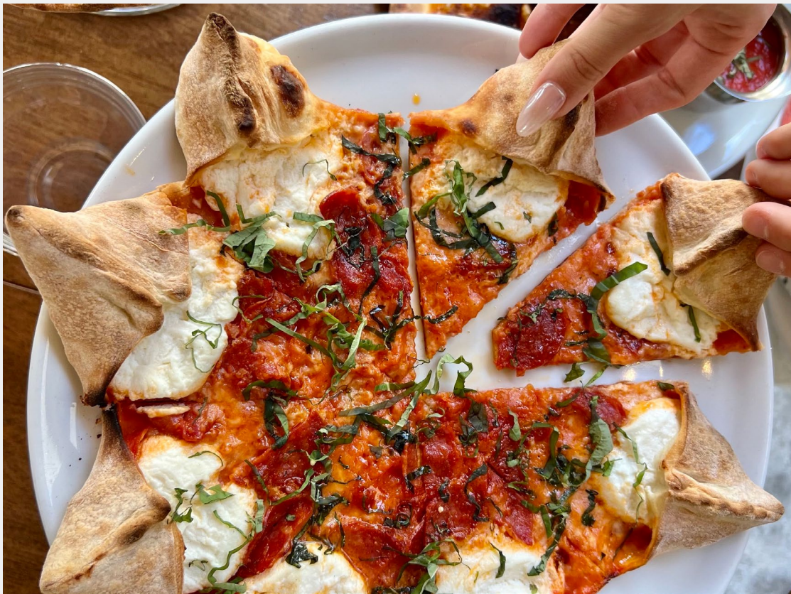
Mister O1 Extraordinary Pizza