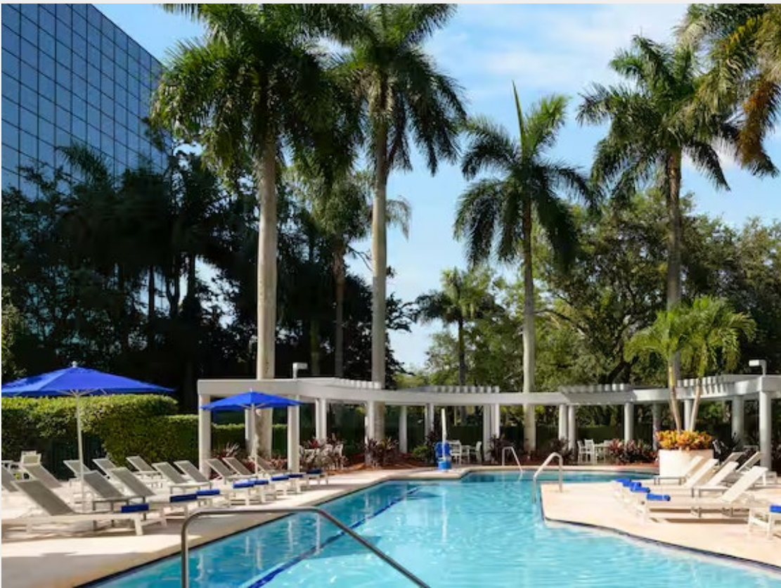
HILTON BOCA SUITES