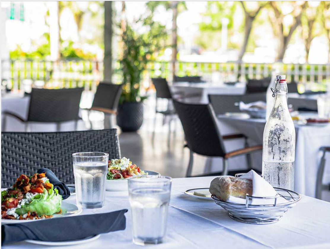
CITY FISH MARKET