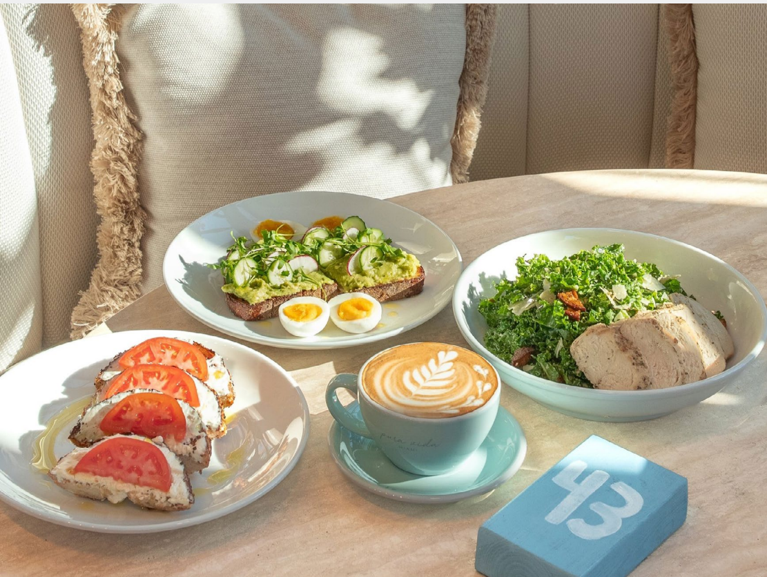
PURA VIDA MIAMI