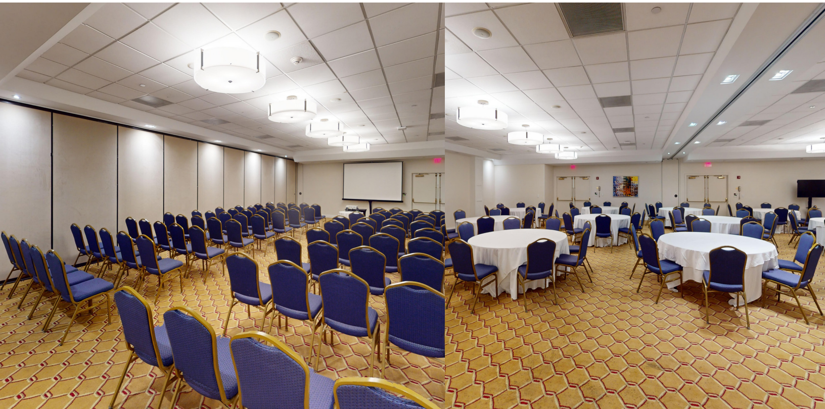
SUBLEASE OFFICE SPACE IN THE MIAMI MARRIOTT DADELAND HOTEL