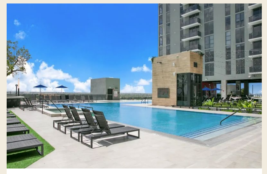
RESORT STYLE ROOF-TOP POOL DECK

Tenants of the FLOW offices get exclusive access to some of the coveted amenities offered on the property.