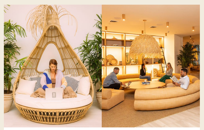
COMMON AREA LOUNGE