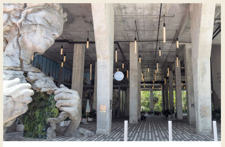
GRAND SENSE OF ARRIVAL — GROUND FLOOR