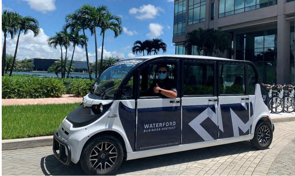
Waterford Business District