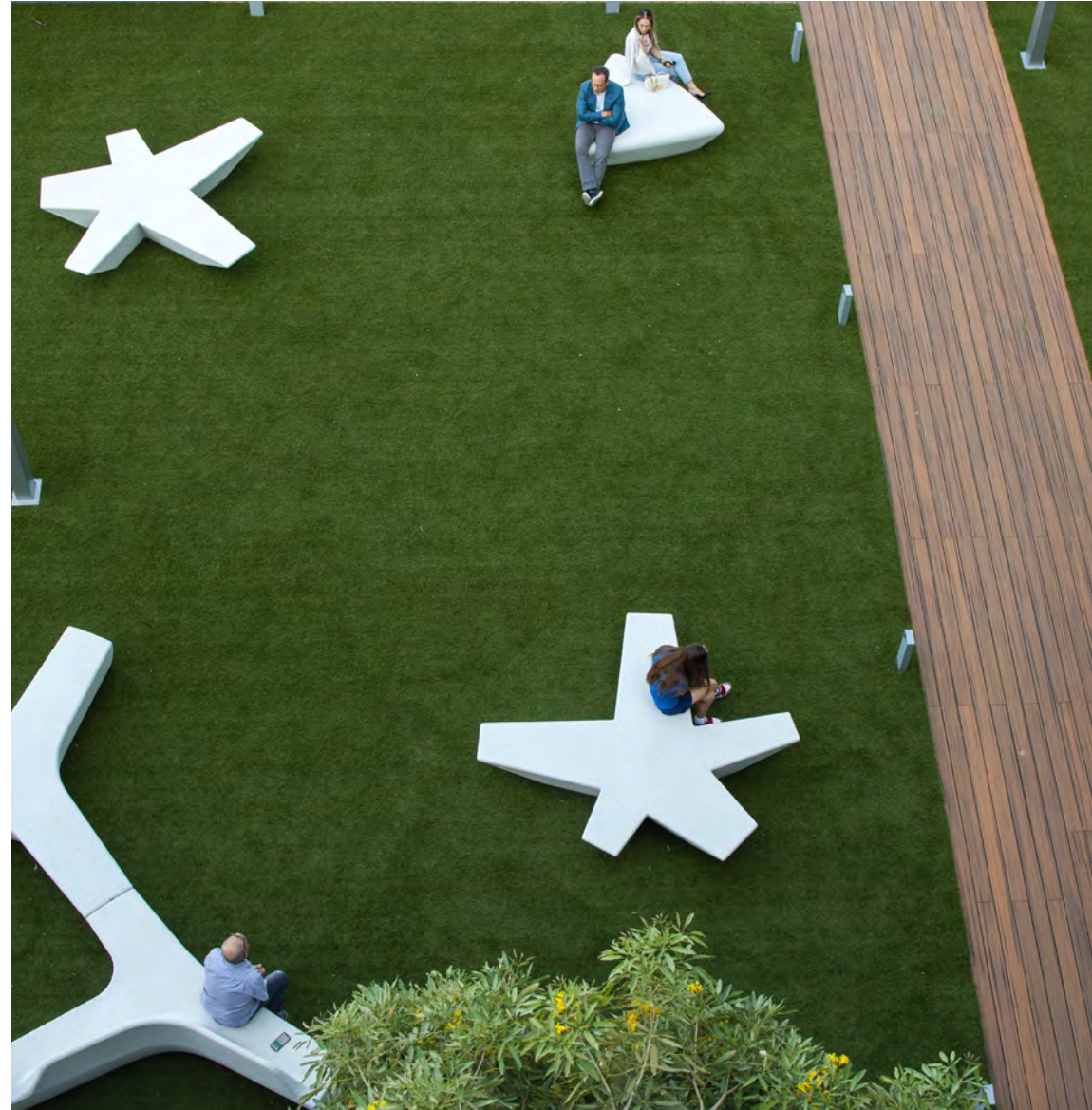
○ Towers Multi-Purpose Rooftop Terrace