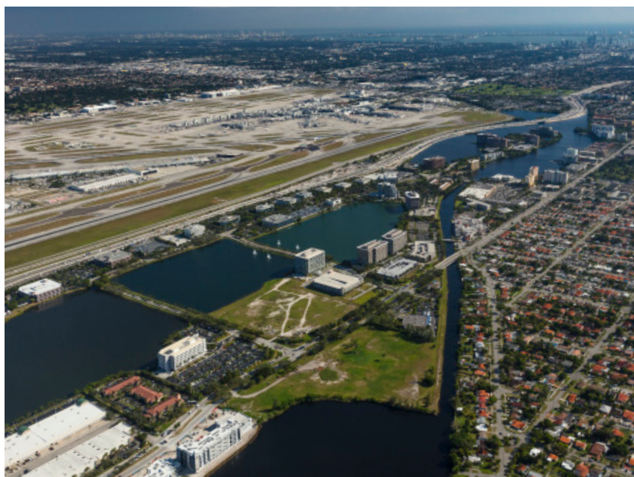
Waterford Business District